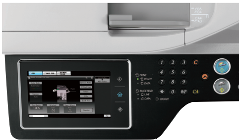
High-resolution touch screen with Stylus pen for easy point-and-touch operation