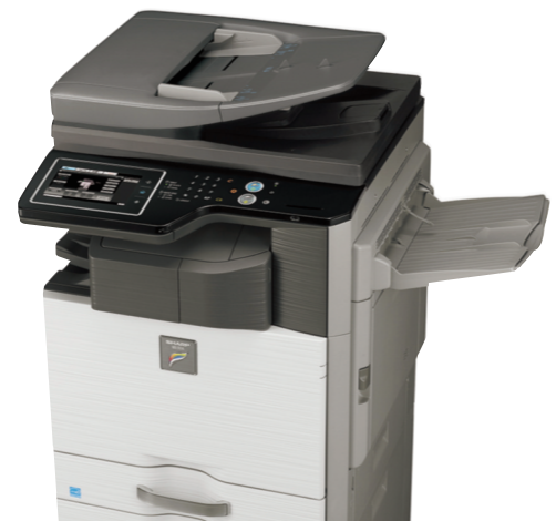
The MX-3115N shown with compact inner finisher.

The MX-2615N/3115N also offers a compact, high-performance finisher with 3-position stapling and an available 3-hole punch that can give your documents a professional look and feel. In addition, an optional long paper feeding tray adds the availability of banner printing within the compact footprint of the MX-2615N/3115N.