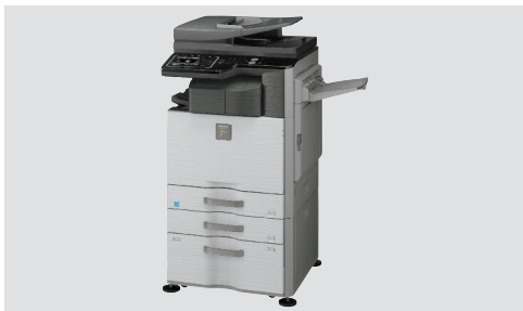
Available paper capacity stores up to a maximum of 3,100 sheets with options