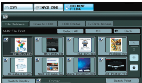
Sharp's easy-to-use Document Filing System with thumbnail preview